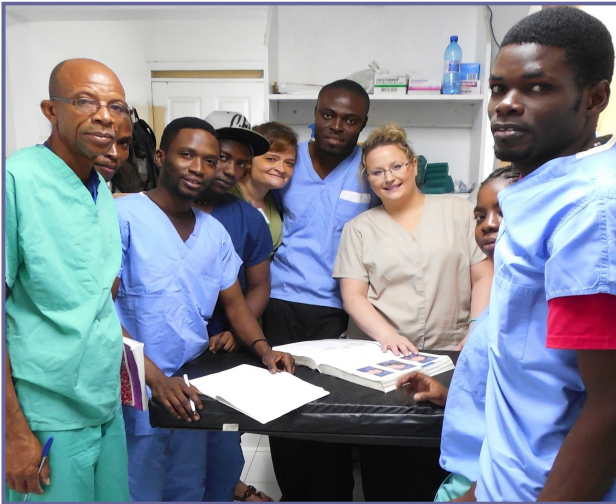
Rad techs in training along with their instructors at Hospital Bernard Mevs.